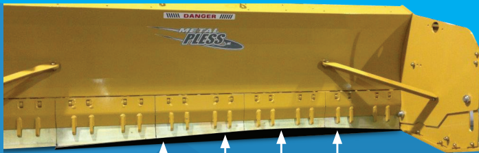
↑ Mobile steel trip edge, reduces use of salt and abrasives