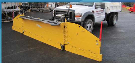
The width of the blade does not determine the real dimension of the product. Pictures might show options.