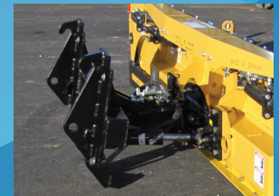
Different types of quick attach available

The width of the blade does not determine the real dimension of the product. Pictures might show options.