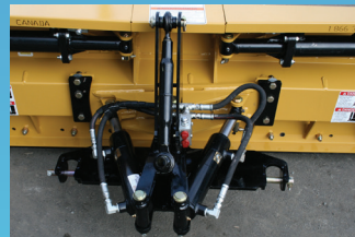
3 points hitch attachment