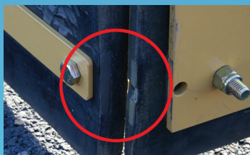
Reinforced rubber edge